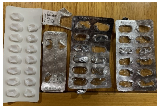
50% aluminum/50% plastic

Bring the following Lids - milk, soft-drink and water bottle lids only. Please remove and discard the foam insert. Please ensure ALL lids are CLEAN and DRY.