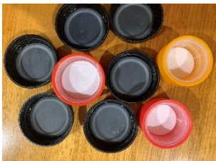
Lids with plastic inside

Lids for Kids also collect lids that have plastic inside and push-pull lids. They give these to schools for craft etc. If you are bringing these lids, please separate them from the milk, soft-drink and water bottle lids.