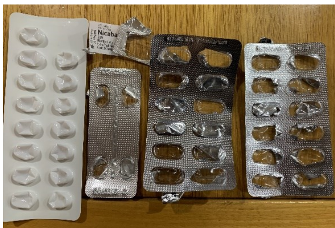
50% aluminum/50% plastic