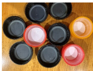
Lids with plastic inside

Lids for Kids also collect lids that have plastic inside and push-pull lids. They give these to schools for craft etc. If you are bringing these lids, please separate them from the milk, soft-drink and water bottle lids.